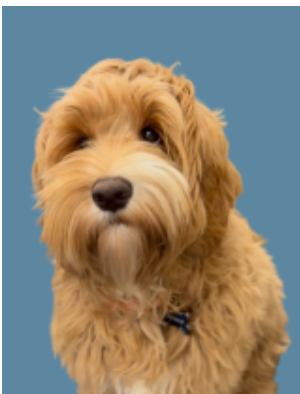
Physis the Therapy Dog

Pediatric, Fellowships, Pediatric, Spine