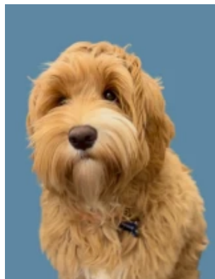
Physis the Therapy Dog

Elbow, Specialties, Shoulder, Sports Medicine